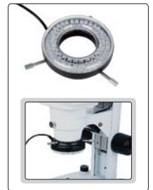
LED ring light (optional)